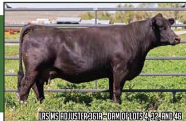
LRS MS ADJUSTER 361A - DAM OF LOTS 4, 32, AND 46

Heifer bull. Check out the indexes on this bull. Dam was born in 2009 and had 8 natural calves with a calving interval of 362 days.