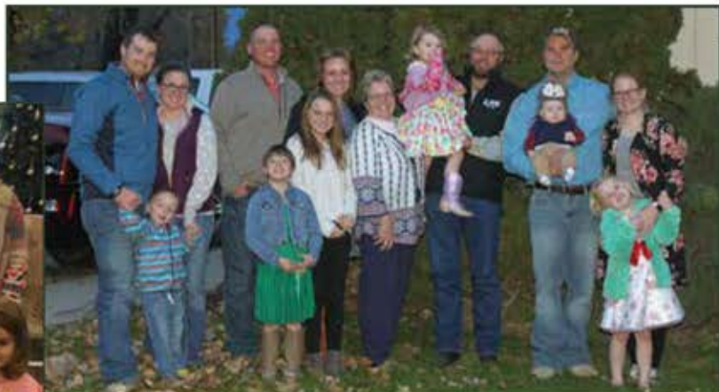
The Lassle Family