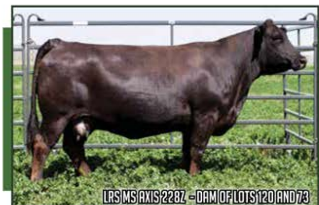
LRS MS AXIS 228Z - DAM OF LOTS 120 AND 73

Larger framed Substance grandson who is really clean in his joints and athletic as he gets out on the move.