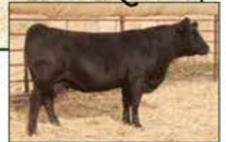
LRS Ms Class Act 437B Dam of Lot 2